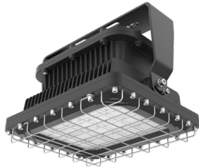
Ceiling (shown with wire guard) (#WG01 ordered separately)