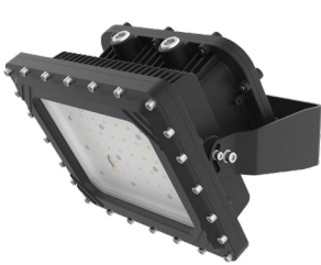
Wall / Flood