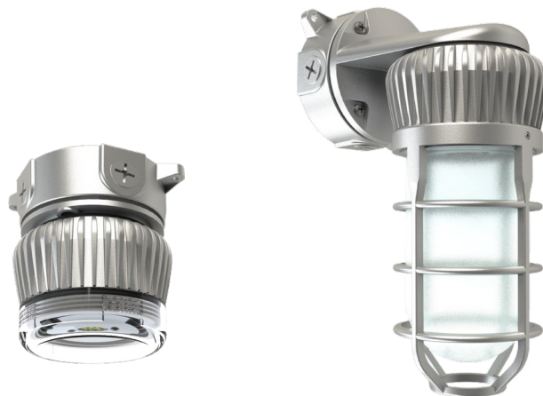
(C) Ceiling Mount (L1) Clear Poly, Low Profile

Mounting: Ceiling, Pendent, Wall Vapor proof 5 Year Warranty