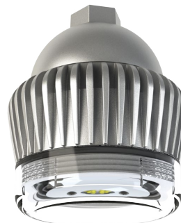
(P) Pendant Mount (L1) Clear Poly, Low Profile

Mounting: Ceiling, Pendant, Wall Vapor proof 5 Year Warranty