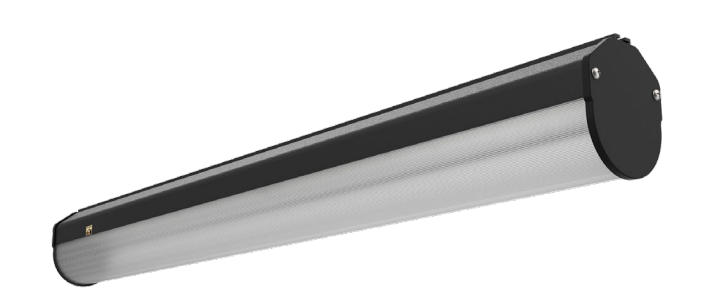
Consult LDPI Sales for available NOM Certified Configurations