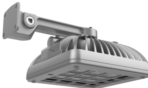
Shown with X1 (Wall Mount) and G (Lens Guard) options

*For reference only. .ies files available upon request.